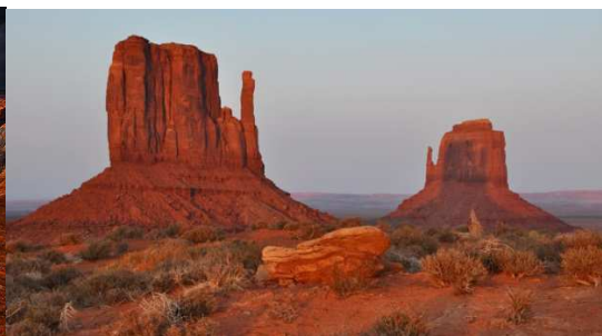
Mittens in Monument Valley